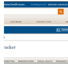
Which Health Services are Free for You?