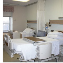
Financial Stability for Hospitals in Connecticut