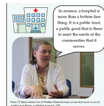
Cuts at Windham Hospital prompt worries about access to care