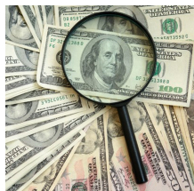
Health Insurance Rates Should Factor in Affordability