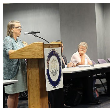
Consumers Ask Regulators To Scrutinize Rate Requests