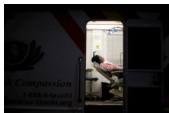
Repealing Obamacare Could Leave 59 Million Americans Uninsured