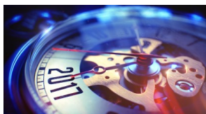
Time Will Reveal: Will We Be Able to Live Our Healthiest Lives?