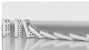
Fighting for Health Care: The Time to Resist is Now